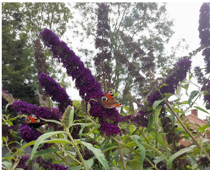
Peacock Butterflies on Buddleia