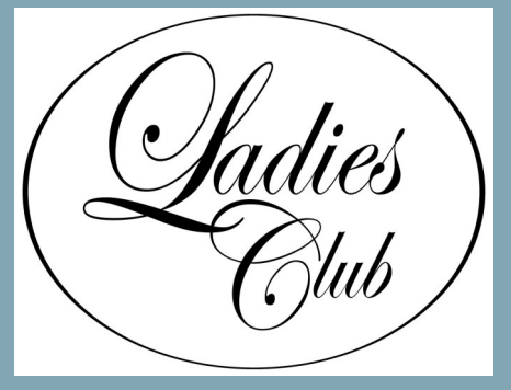
21st November 2p.m. Yaxley Village Hall

Looking forward to seeing you all at 2pm, the village hall, Yaxley, IP23 8BX