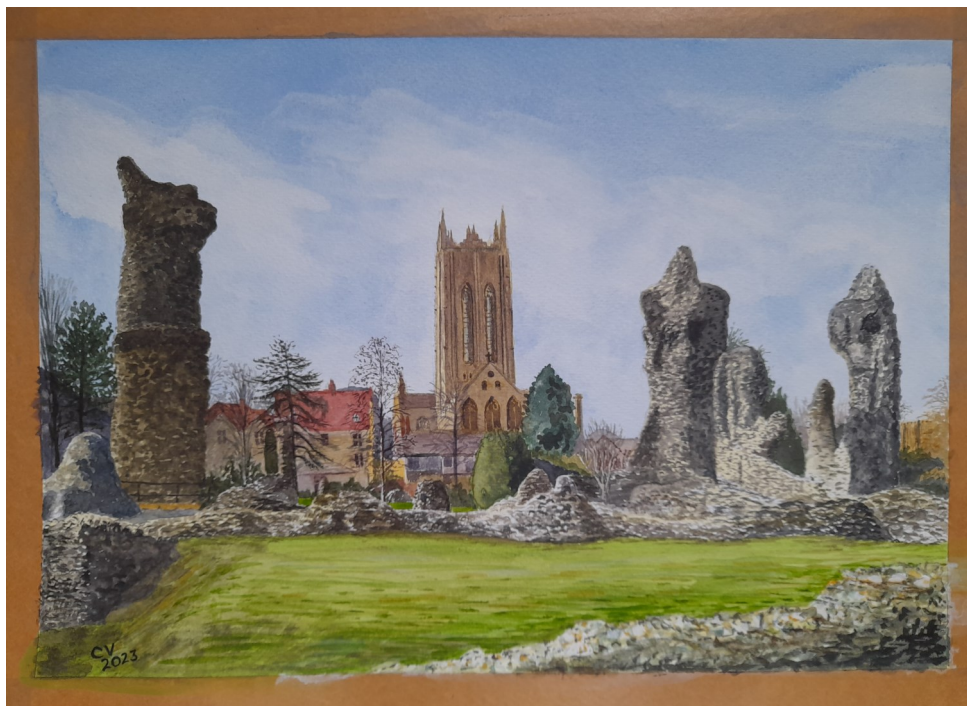
Bury St Edmunds Abbey Gardens